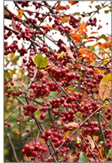
Prairifire Flowering Crab fruit

This tree should only be grown in full sunlight. It prefers to grow in average to moist conditions, and shouldn't be allowed to dry out. It is not particular as to soil type or pH. It is highly tolerant of urban pollution and will even thrive in inner city environments. This particular variety is an interspecific hybrid.