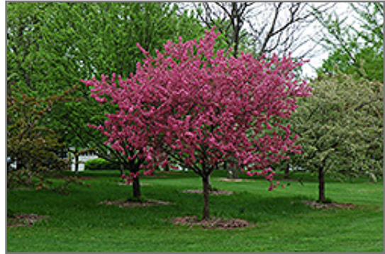
Prairifire Flowering Crab in bloom

This tree will require occasional maintenance and upkeep, and is best pruned in late winter once the threat of extreme cold has passed. It has no significant negative characteristics.