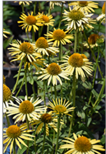
Maui Sunshine Coneflower flowers