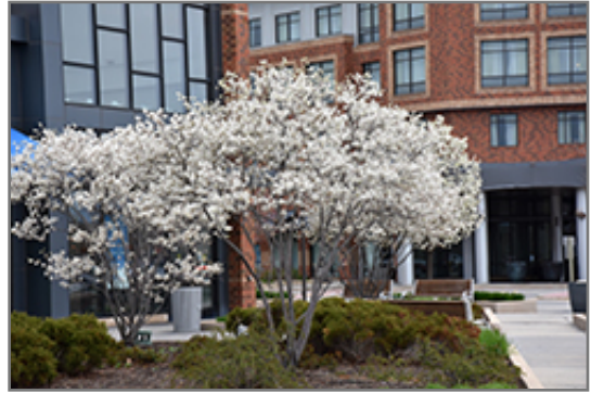
Autumn Brilliance Serviceberry in bloom

Autumn Brilliance Serviceberry is recommended for the following landscape applications;