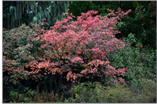
Autumn Brilliance Serviceberry in fall

This tree does best in full sun to partial shade. It prefers to grow in average to moist conditions, and shouldn't be allowed to dry out. It is not particular as to soil type or pH. It is somewhat tolerant of urban pollution. This particular variety is an interspecific hybrid.