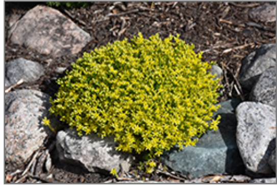
Golden Moss Stonecrop in bloom

Golden Moss Stonecrop is recommended for the following landscape applications;