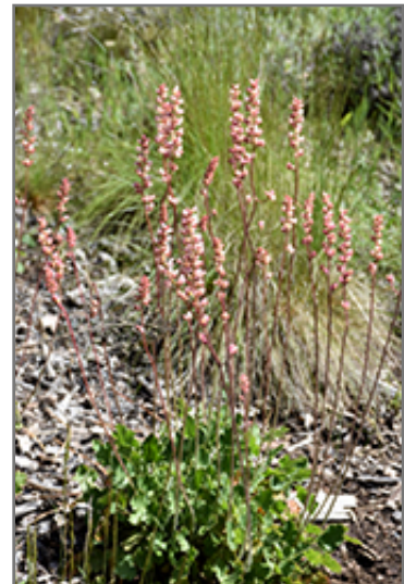
Poker Heuchera in bloom