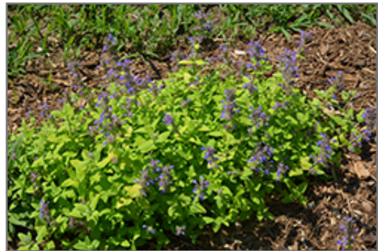
Chartreuse On The Loose Catmint in bloom