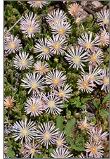
Alan's Apricot Ice Plant flowers