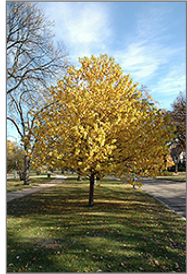
Amur Cherry in fall

This tree should only be grown in full sunlight. It does best in average to evenly moist conditions, but will not tolerate standing water. It is not particular as to soil type or pH. It is somewhat tolerant of urban pollution. This species is not originally from North America.