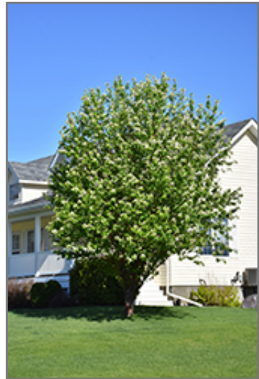
Amur Cherry