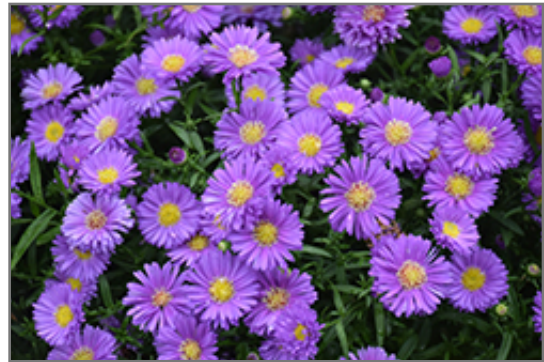
Magic Purple Aster flowers

Magic Purple Aster is recommended for the following landscape applications;