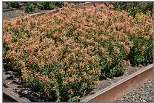
Kudos Gold Hyssop in bloom