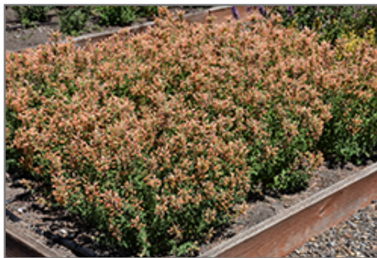
Kudos Gold Hyssop in bloom