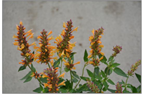
Kudos Gold Hyssop flowers