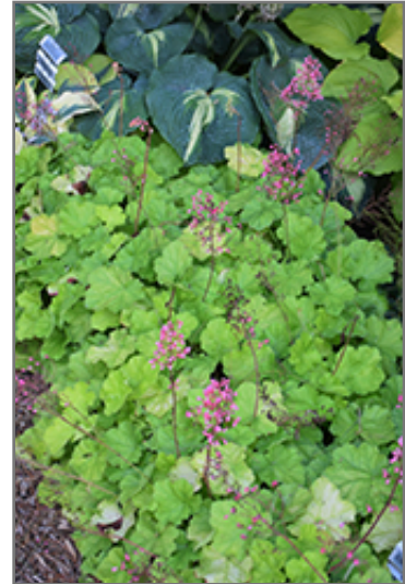
Primo Pretty Pistachio Coral Bells in bloom

This is a relatively low maintenance plant, and should be cut back in late fall in preparation for winter. It is a good choice for attracting butterflies and hummingbirds to your yard. It has no significant negative characteristics.