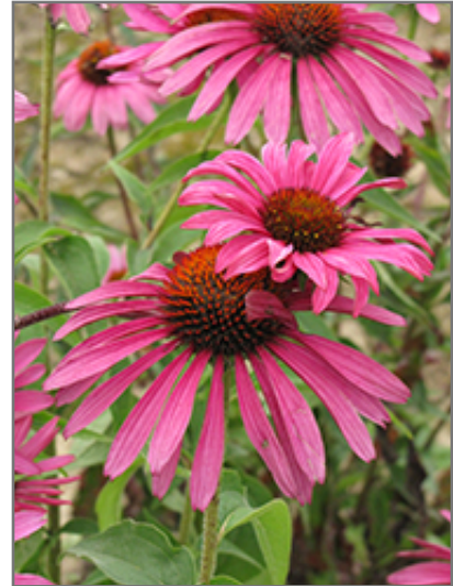
Ruby Star Coneflower flowers