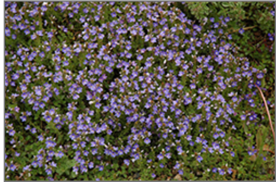
Turkish Speedwell in bloom

Turkish Speedwell is recommended for the following landscape applications;