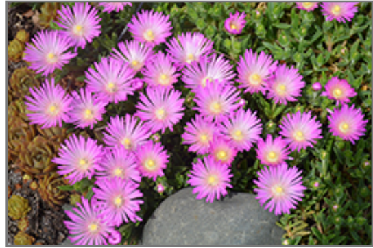
Table Mountain Ice Plant flowers

Table Mountain Ice Plant is recommended for the following landscape applications;