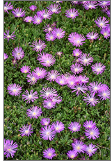
Table Mountain Ice Plant flowers

Table Mountain Ice Plant is a fine choice for the garden, but it is also a good selection for planting in outdoor pots and containers. Because of its spreading habit of growth, it is ideally suited for use as a 'spiller' in the 'spiller-thriller-filler' container combination; plant it near the edges where it can spill gracefully over the pot. Note that when growing plants in outdoor containers and baskets, they may require more frequent waterings than they would in the yard or garden. Be aware that in our climate, most plants cannot be expected to survive the winter if left in containers outdoors, and this plant is no exception. Contact our experts for more information on how to protect it over the winter months.