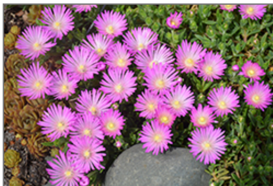
Table Mountain Ice Plant flowers

Table Mountain Ice Plant is recommended for the following landscape applications;