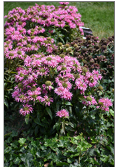
Pardon My Pink Beebalm in bloom