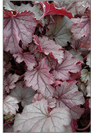
Little Cuties Sugar Berry Coral Bells foliage

Little Cuties Sugar Berry Coral Bells is recommended for the following landscape applications;