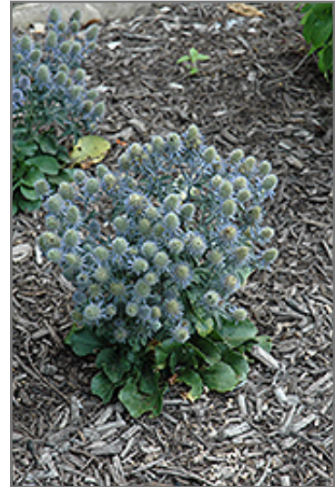
Tiny Jackpot Sea Holly

Tiny Jackpot Sea Holly is recommended for the following landscape applications;