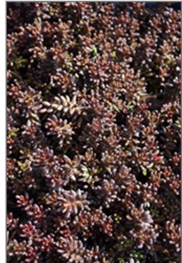
Murale Stonecrop foliage