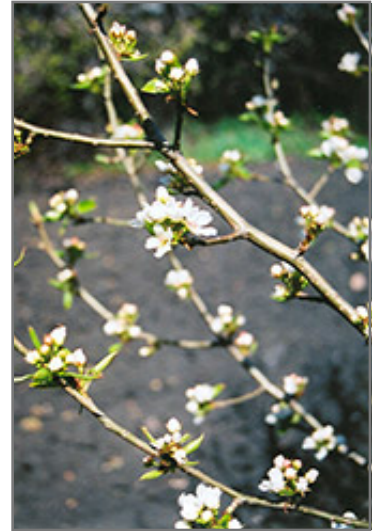
Mountain Frost Pear flowers

This tree should only be grown in full sunlight. It does best in average to evenly moist conditions, but will not tolerate standing water. It is not particular as to soil type or pH. It is highly tolerant of urban pollution and will even thrive in inner city environments. This is a selected variety of a species not originally from North America.